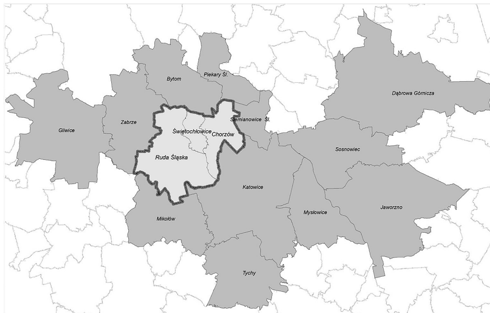
Fig. 1. Delimitation of FUA